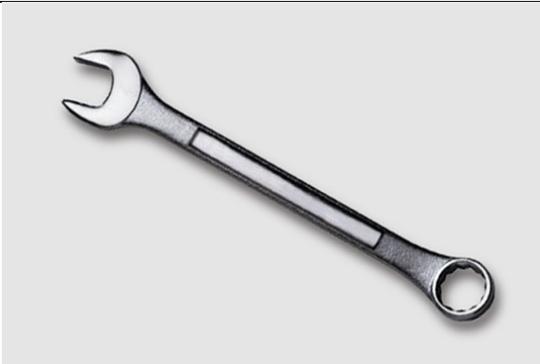
Open Box Wrench This is used to loosen nuts